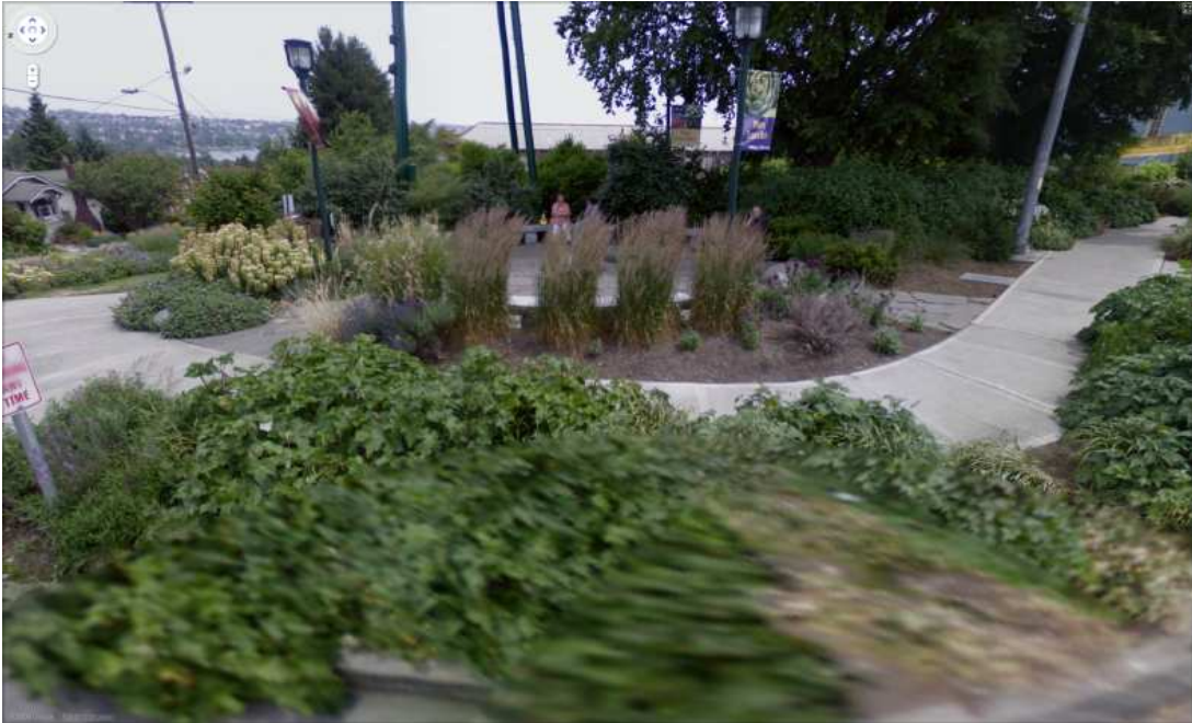
(pocket park at Phinney Ave. & N 67th St)