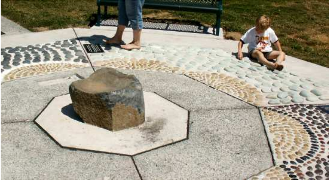
(Marymoor Park, Seattle WA) Kingcounty.gov