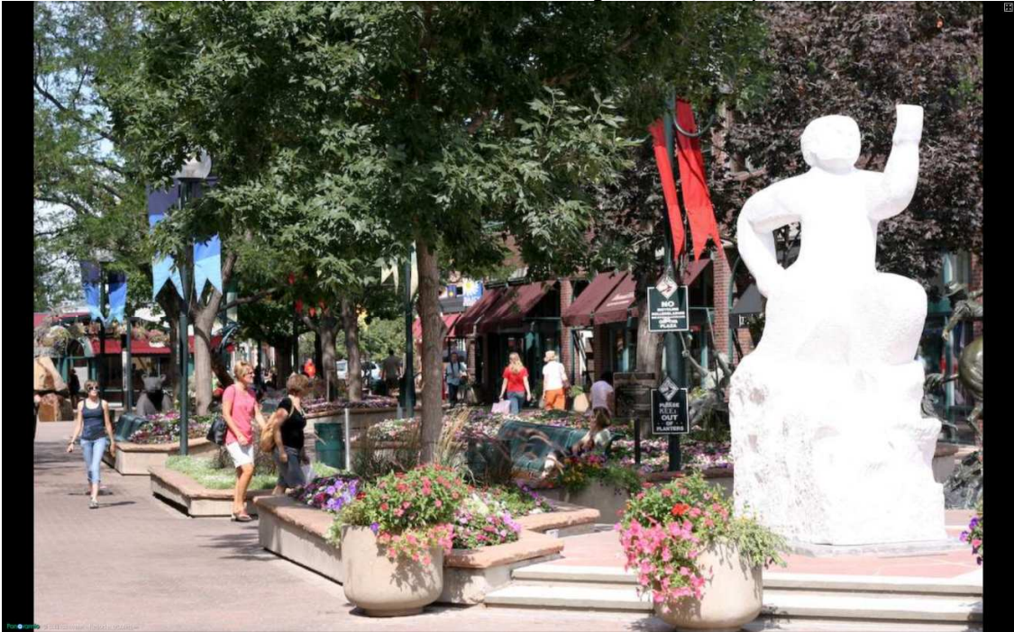
(Old Town Square, Fort Collins CO) Panorama@colinstravele , www.maps.google.com