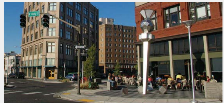
DRAFT DOWNTOWN BELLINGHAM PLAN February, 2014