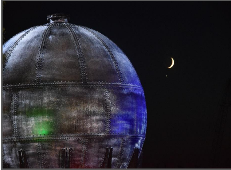
Acid Ball at Waypoint Park.

The following recommendations for park, recreation and open space facilities in Bellingham are based on the results of existing inventories, needs analysis (trends, population, level-of-service), public input, workshop, and surveys. A detailed list of each proposed facility is included in Appendix C of the PRO Plan.