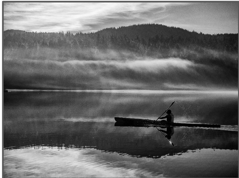
Lake Padden Park.