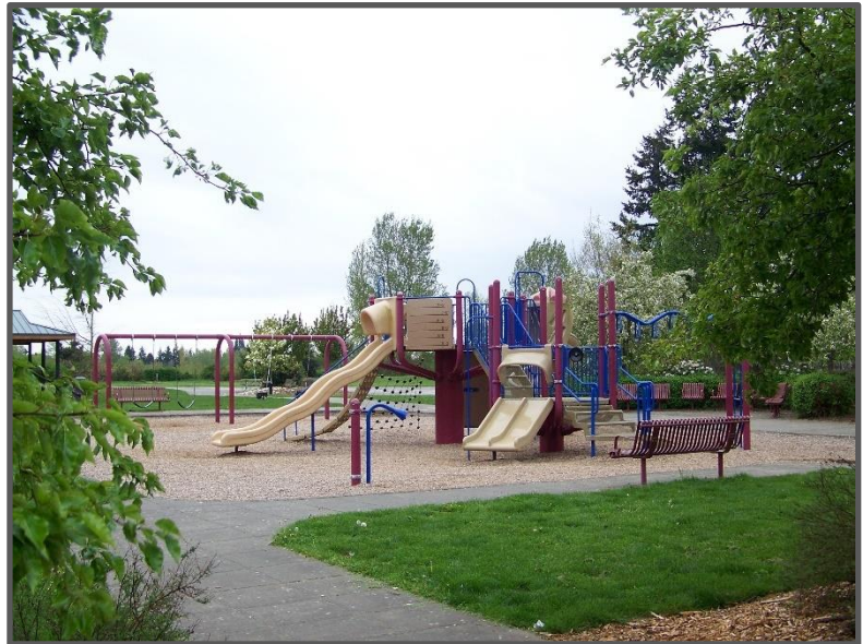
Birchwood Park.