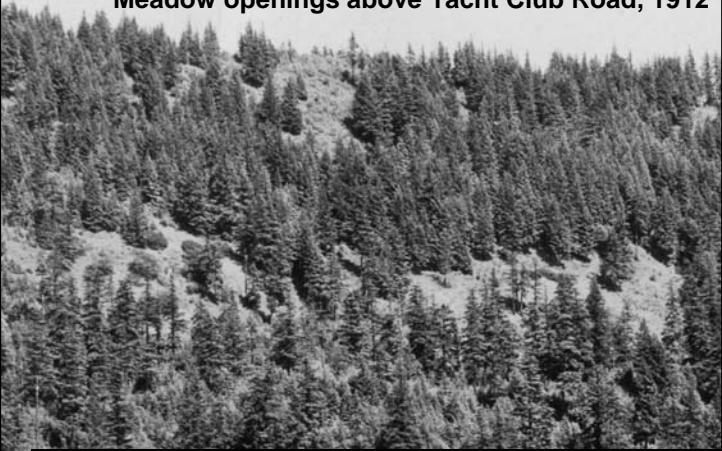
Meadow openings above Yacht Club Road, 1912