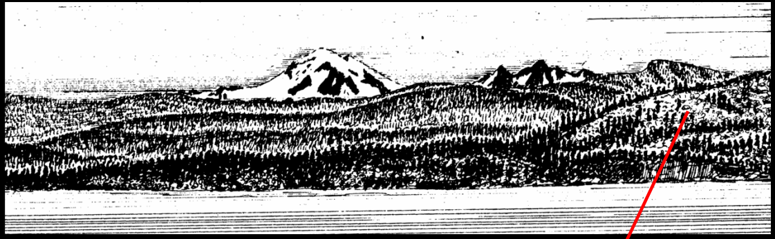
North end of the Chuckanut burn, 1887

Repeated fires on the west face of Chuckanut have contributed to a distinct pattern of vegetation. Larger woody species that reveal this history today include shore pine, soopolalie (buffalo berry), hairy manzanita, Garry oak and red-stem ceanothus. USGS sketch of 1887.