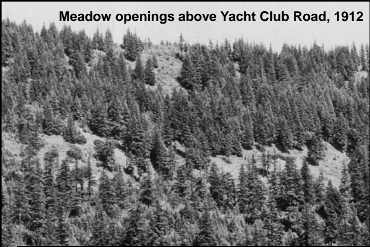
Meadow openings above Yacht Club Road, 1912