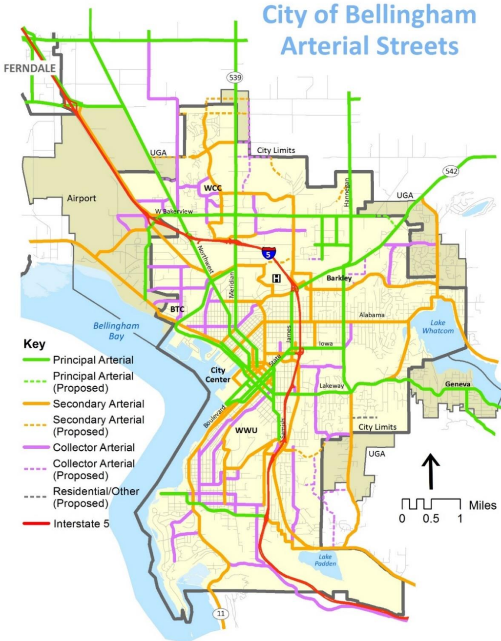
Figure 9.1. Bellingham's Arterial Street Network