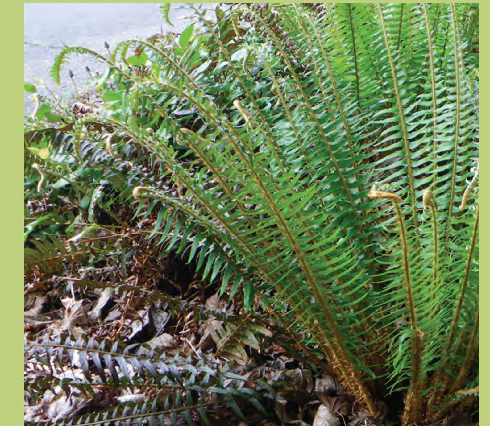
Leaf Mulch 2 to 3 inches thick