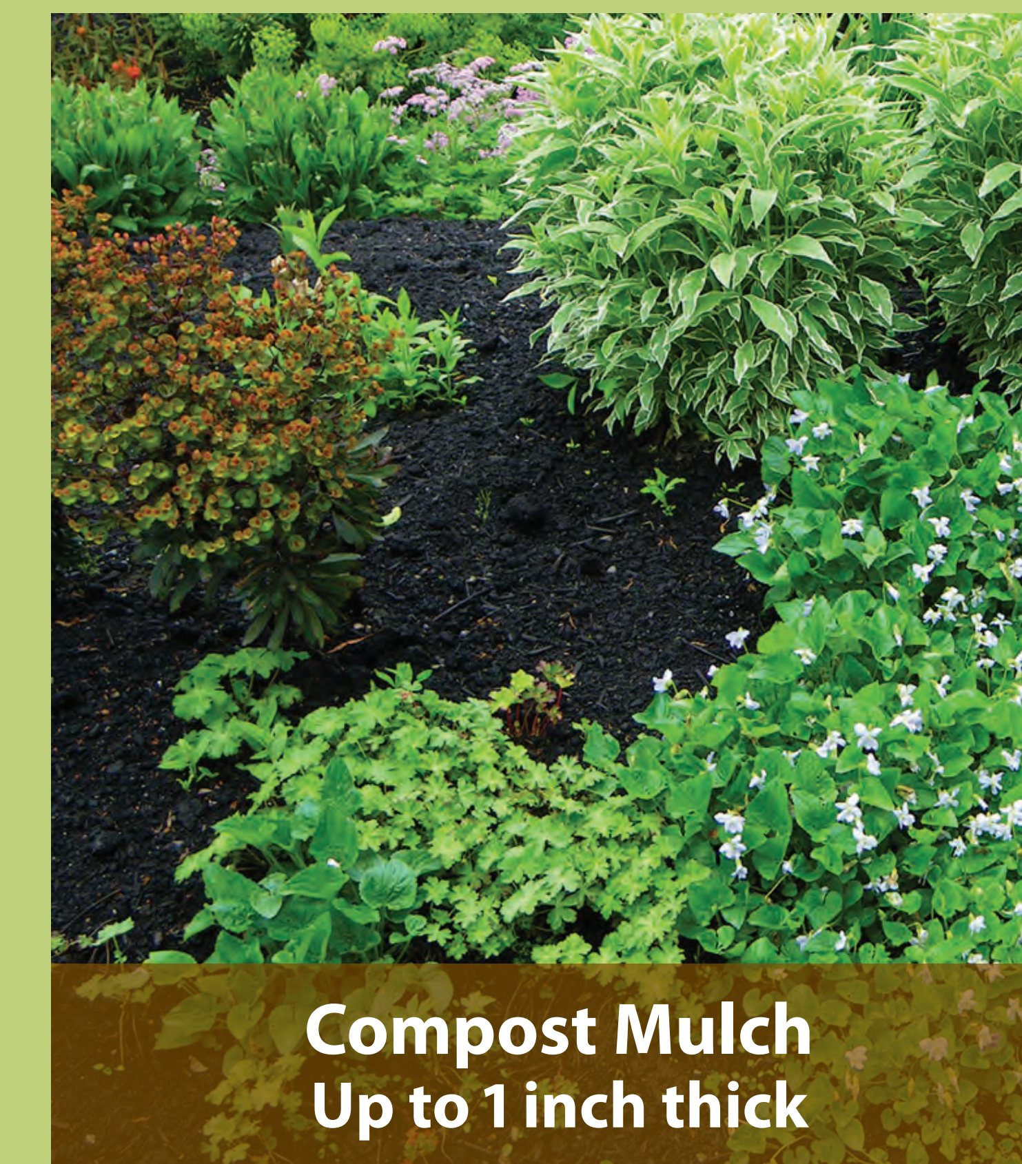
Compost Mulch Up to 1 inch thick