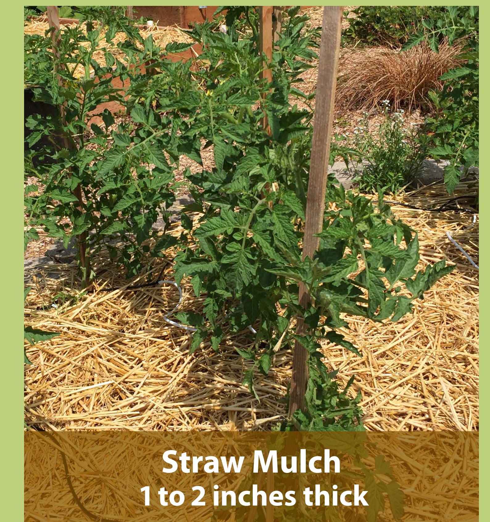
Straw Mulch 1 to 2 inches thick