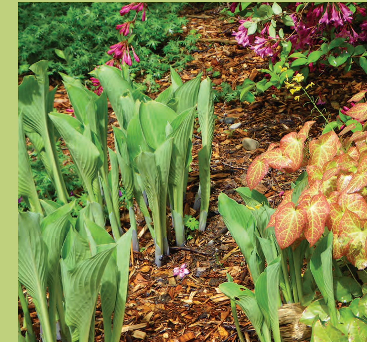
Wood Chip Mulch 3 to 4 inches thick