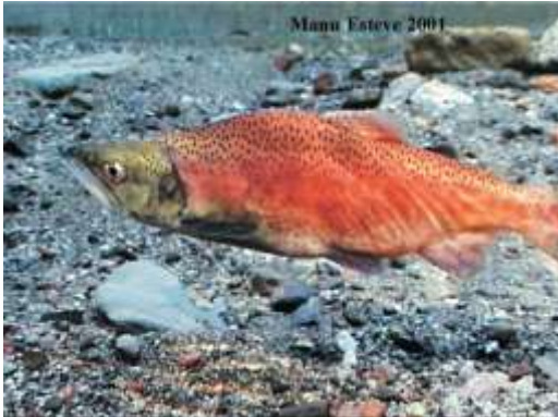
Male kokanee

Kokanee ( Oncorhynchus nerka ) are sockeye salmon that spend their entire lives in freshwater. They are usually found in lakes that have either limited or no access to the ocean.