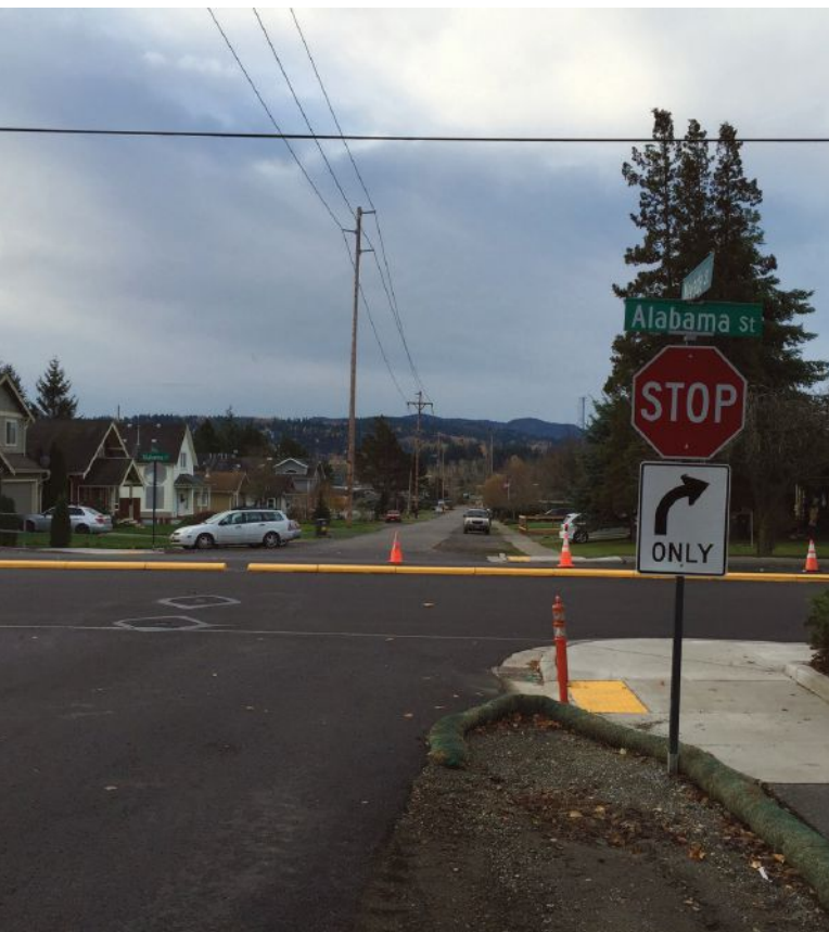
C-curb median access management at side streets and alleyways to reduce vehicle collisions while adding safe crossings.