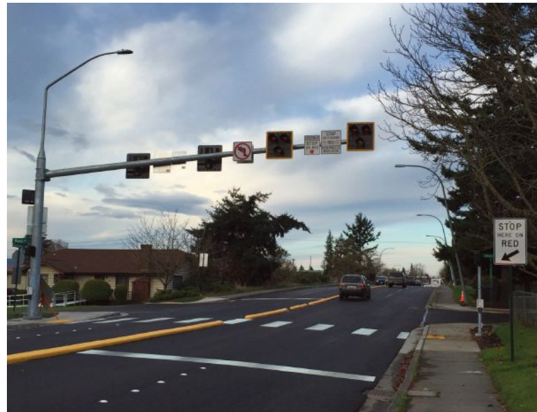
4-to-3-lane road diet with center turn lane and HAWK crossing signals for pedestrians, transit riders, bicyclists, and vehicle safety.