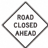
W20-3 30" X 30" BLACK ON ORANGE