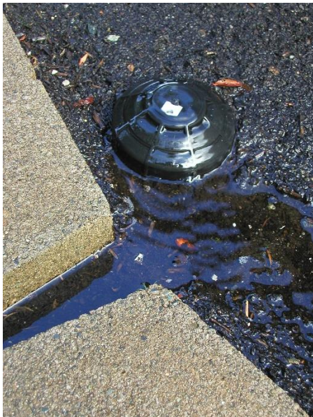
Example of low-head drainage

Save water and money on the water bill because you stop water from leaking out of the irrigation line each time it shuts off.