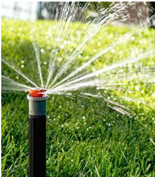
Example of an efficient nozzle

In many irrigation zones, there are nozzles that spray water out in a range of patterns. Some might put the water out in a 90-degree range, others at 180 degrees, and some at 360 degrees. Unless the nozzles have what is called matched precipitation rates, the water coming out of the 90-degree nozzle puts out 4 times as much water per square foot as the 360-degree nozzle. This means that if a zone with 360-degree nozzles needs to be run 4 times longer than zones with 90-degree nozzles.