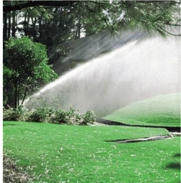
Example of too high pressure leading to water blowing

The best place for the pressure reduction depends on the system, how high the pressure is, and the equipment. Reducing the pressure too much at the front end of the system may lead to low pressure at the end of the farthest zones. It may be that most zones and heads have good pressure but that a few zones have excessive pressure and those zones could benefit from installation of a pressure-reducing valve.