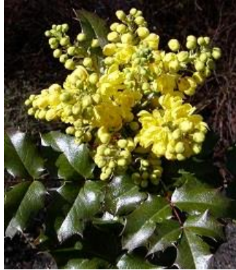
Oregon Grape, Mahonia aquifolium