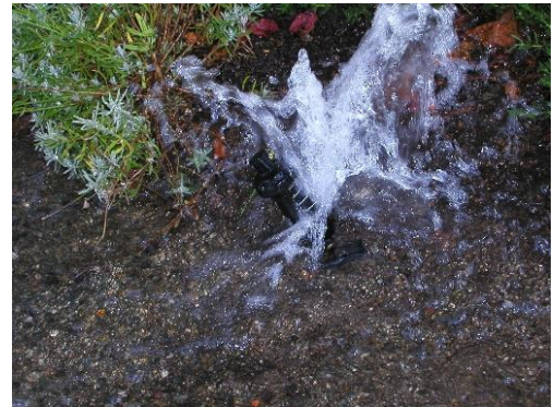
Irrigation head break that might go undetected if system operates at night

Flow sensors will send a signal to let you know that there is a problem in the irrigation system that needs attention now. Without this equipment and without checking meters and billing, water waste from a problem could go on for years.