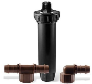
Kit to retrofit spray to drip

Convert pop-up spray head zone to drip irrigation. A conversion can be accomplished in most bed zones by replacing a few heads with connection units with built-in pressure regulators and filters, and drip lines can be run from these units. This allows for capping the other spray heads on the zone. Whichever drip technique you decide to use, be sure to add a filter and pressure reduction.