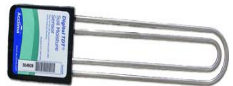
Soil moisture sensor