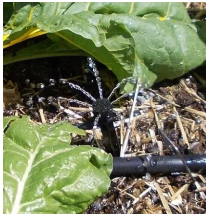
Drip spray example

Save water and money on the water bill because you reduce the water wasted with spray head irrigation on a bed zone.