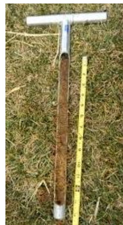
Soil core sampler