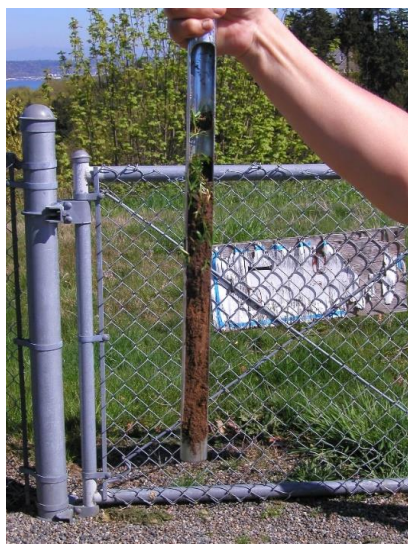
Example of good, deep, loamy soil captured by soil corer

Use a soil corer to check out the soil around your irrigated landscape. Make note of the soil types in each area and how deep the soil is.