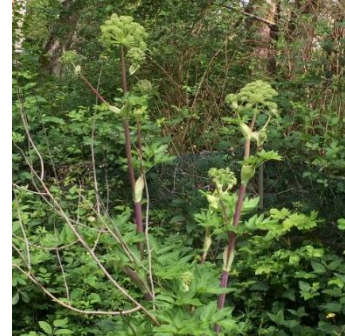
Angelica, Angelica archangelica