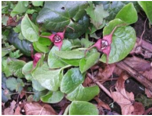
Wild Ginger, Asarum caudatum

You can save water and money on the water bill because you can water the drought-tolerant plants less, and plants will be healthier. Below are some suggested plants.