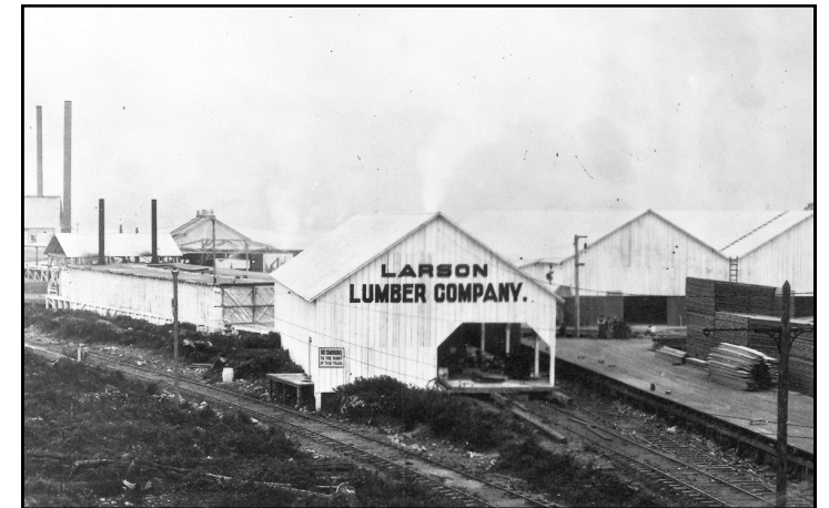
Larson Lumber Company mill, c. 1910