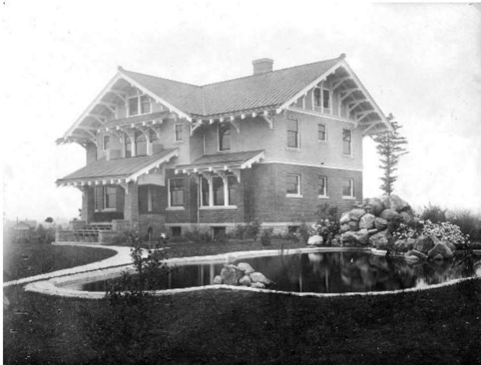
Victor & Effie Roeder House, 2600 Sunset Dr. from SE corner, c. 1910.