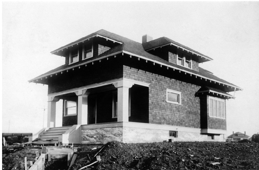
House at 2730 South Park Street, 1907