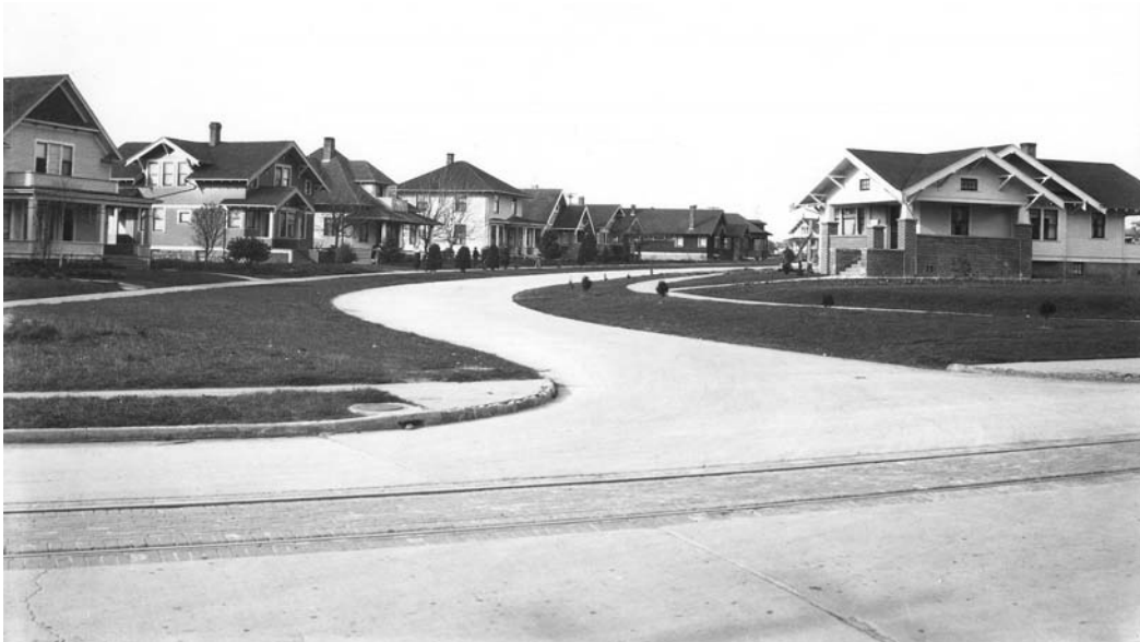
View of Hampton Place from East North Street, c. 1920.