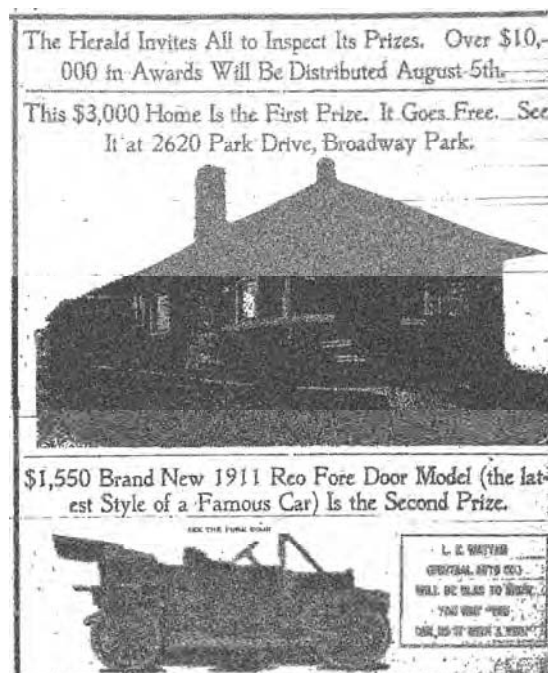
Real Estate Office / Trolley Station was moved to 2620 S. Park Drive in 1911 and given away as part of Bellingham Herald promotional event.