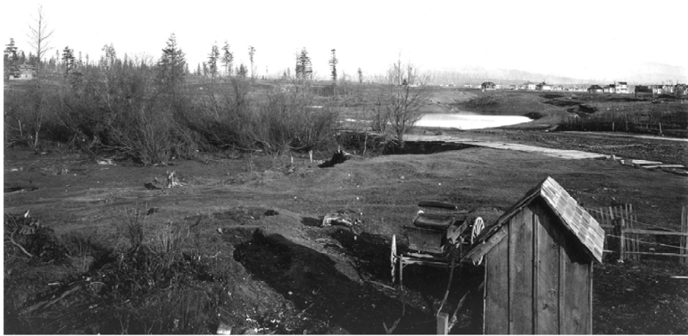
View facing Broadway Park plat, circa 1907. The pond at the western end of park is visible.