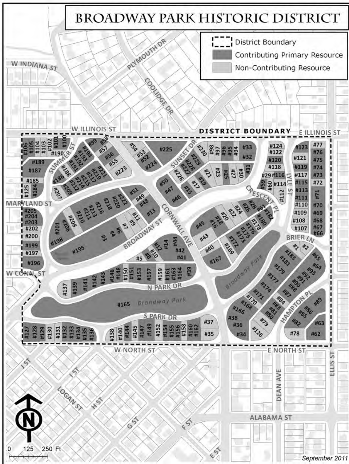
Broadway Park Historic District, showing contributing vs. non-contributing primary resources and identification numbers