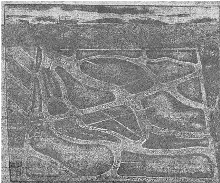
March 16, 1907 advertisement in the Bellingham Herald for the Broadway Park plat