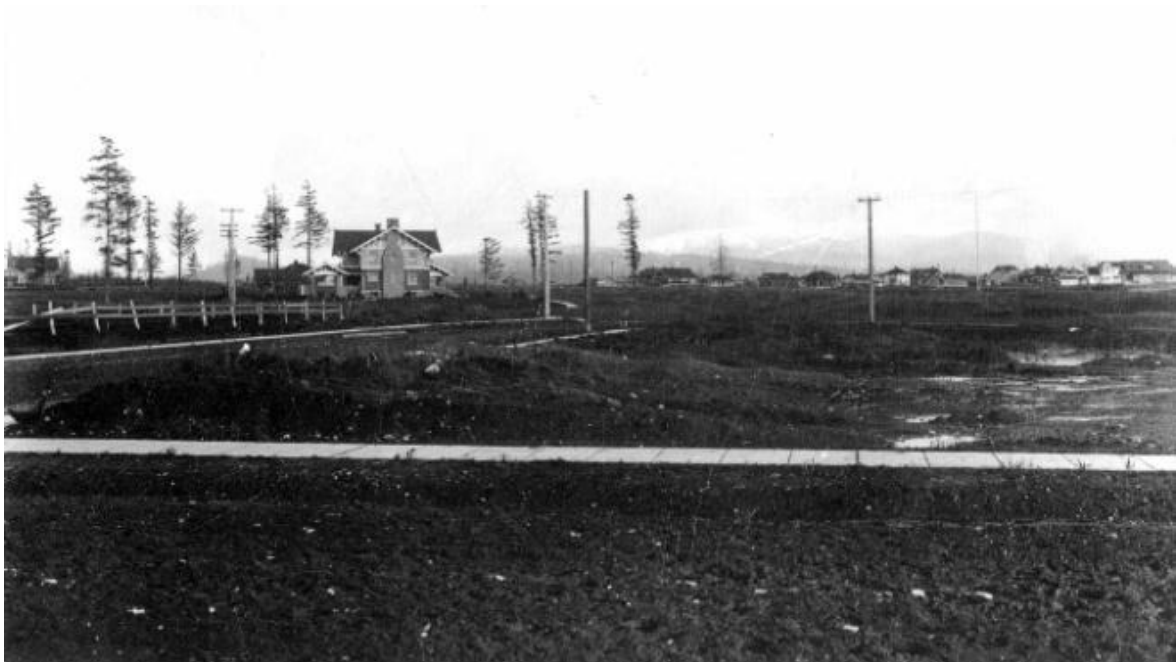
Victor & Effie Roeder House in foreground at left, view looking east, c. 1910.