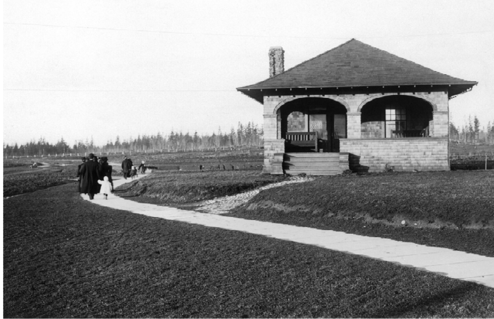
Real Estate Office / Trolley Station at 2606 Cornwall Ave, c. 1908