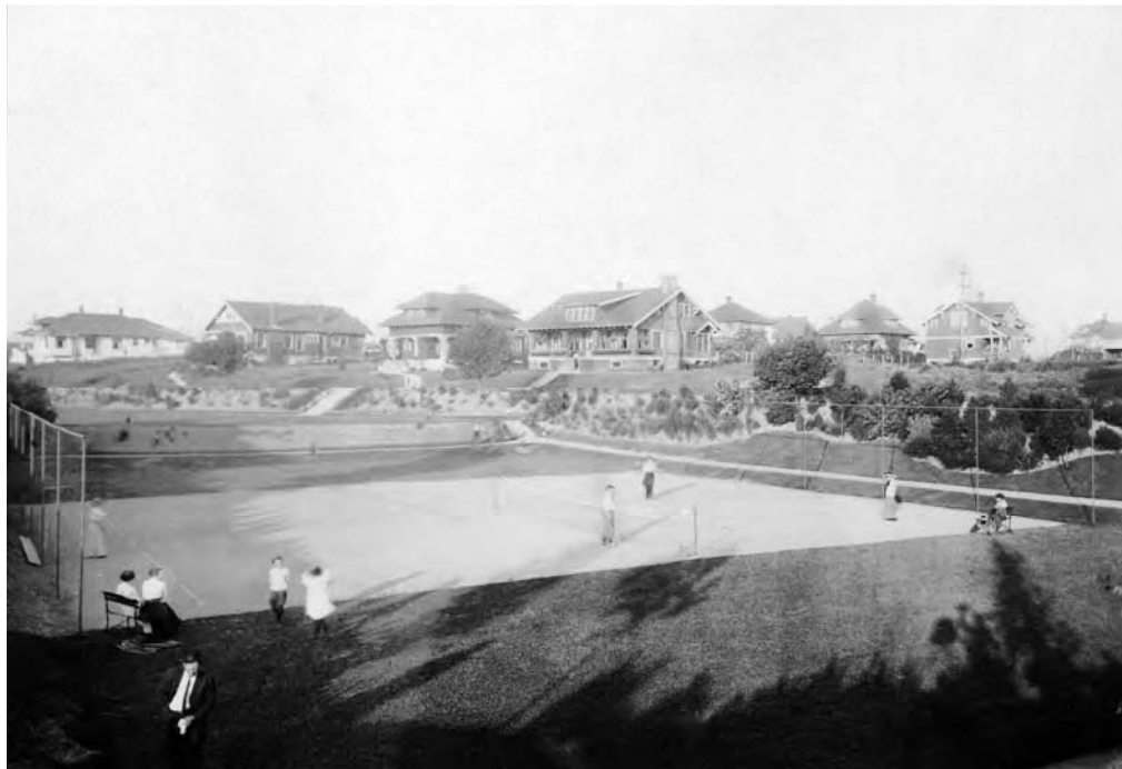
Broadway Park tennis court, taken when park was newly created and houses along park were recently built. c. 1915.