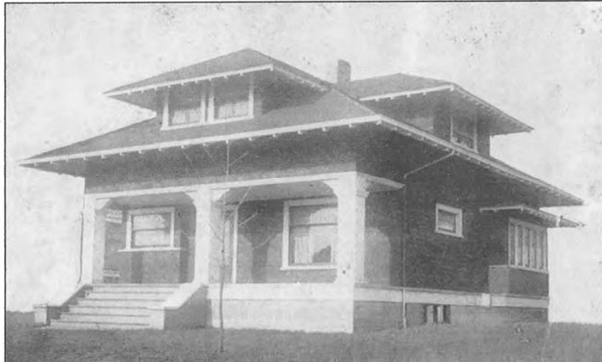
Plan 76A from Victor Voorhees' 1908 Western Home Builder