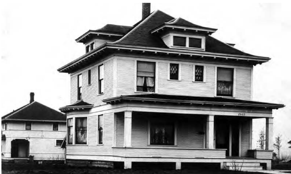
House at 2603 Ellis Street, c. 1914