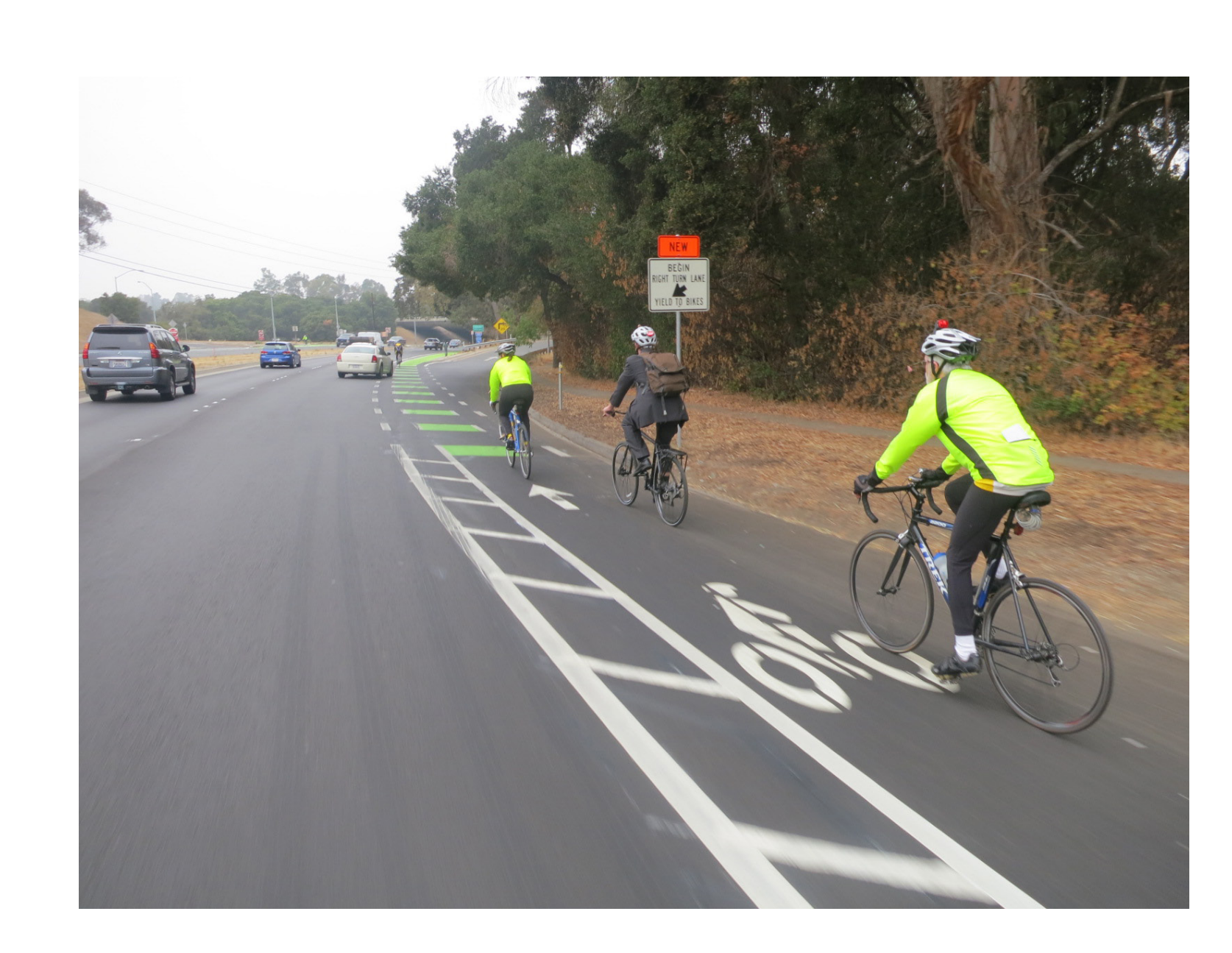
Two-way Protected Bike Lanes