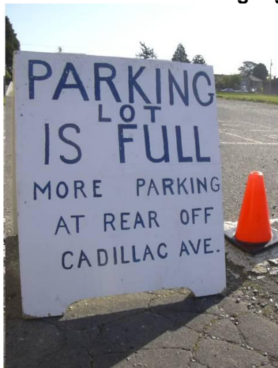
Figure 3 Overflow Parking Sign

Remote parking requires providing adequate use information and incentives to encourage motorists to use more distant facilities. For example, signs and maps should indicate the location of peripheral parking facilities, and they should be significantly cheaper to use than in the core. Without such incentives, peripheral parking facilities are often underused while core parking is congested.